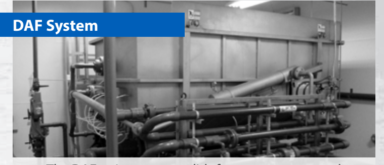
The DAF unit removes solids from wastewater and discharges clarified effluent