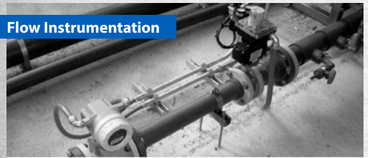
Flow instrumentation is used to control flow and chemical dosing rates on a skid system