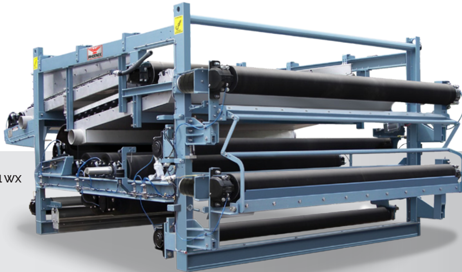
PHOENIX Model WX Belt Filter Press

PHOENIX Model WX Belt Filter Press dewateres slurry of pre-thickened solids from a pumpable, liquid state to a solid, belt conveyable and stackable cake. Model WX is available in several different configurations, each suited to the specific application. Design includes fully welded mainframe, oversized bearings, and unique corrosion protection features. Several different compression zone arrangements are available.